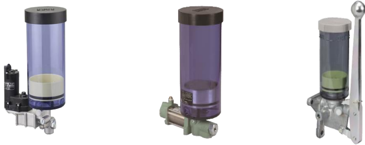
Pump (Motor driven · Air-operated · Manual)

The small centralized lubrication system developed for vehicle and industrial machinery (High quality · Proper amount supply · Compact)